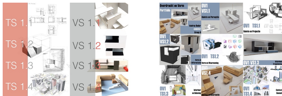
Fig. 03. Two examples of F&V1 digital Portfolio files.

To get the students to 'hit the ground running' when it comes to this sub-project, an integral workshop is organised during the first F&V2 day, whereby students are asked to develop a concept on the spot, by drawing and physically modelling a first concept, which they take with them to their first MS lesson.