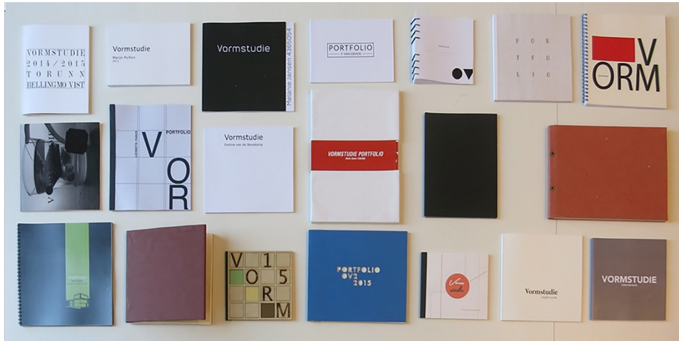
Fig. 04. A selection of FS booklets handed in at the end of F&V2.

The aspect of graphic visualisation is a central theme, whereby platforms like Illustrator and InDesign are brought under the students' attention.